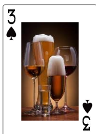
3 times more likely to drink alcohol