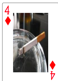
4 times more likely to smoke cigarette