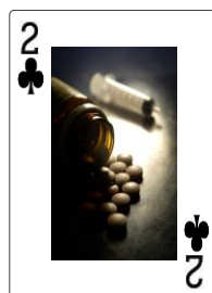
2 times more likely to use illegal drugs