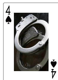
4 times more likely to get into trouble with the police